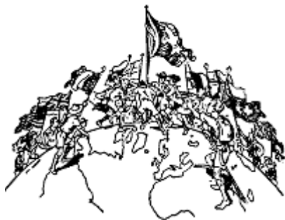
Scouts of the World, Brothers Toaether

We have now 1,011,923 British Scouts and 544,544 British Guides. In addition to these, some fifty-two countries have taken up Scouting and many also have Guides, so that altogether in the world there are now 2,812,00 Scouts and 1,304,107 Girl Guides.